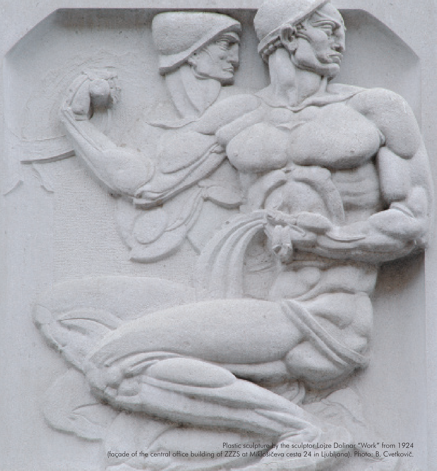
Plastic sculpture by the sculptor Lojze Dolinar "Work" from 1924 (façade of the central office building of ZZS at Miklošičeva cesta 24 in Ljubljana).