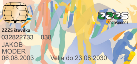
The front of the health insurance card.