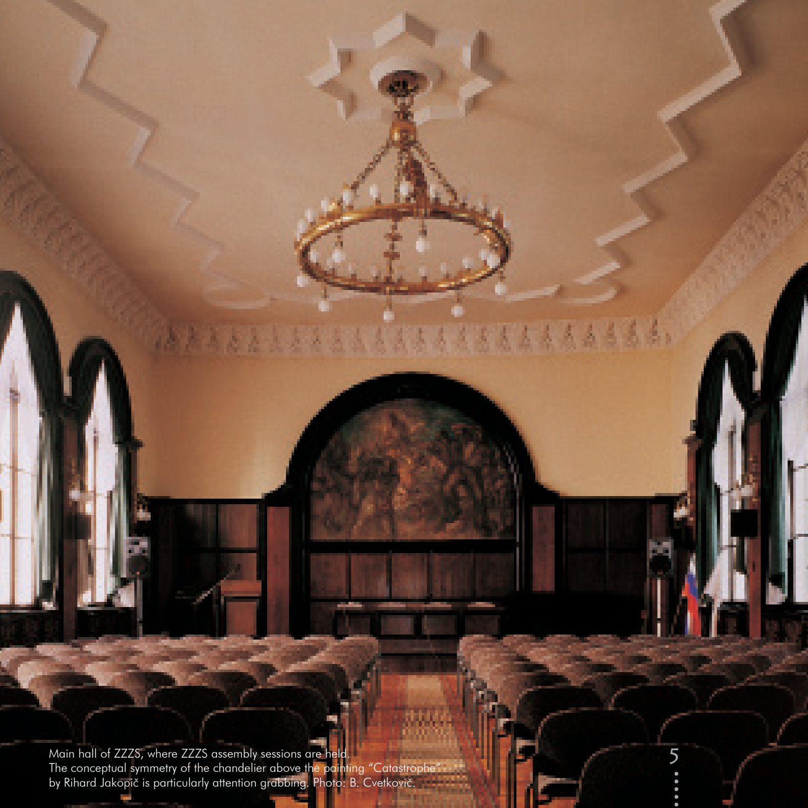
Main hall of ZZS, where ZZS assembly sessions are held. The conceptual symmetry of the chandelier above the painting "Catastrophe" by Rihard Jakopič is particularly attention grabbing.