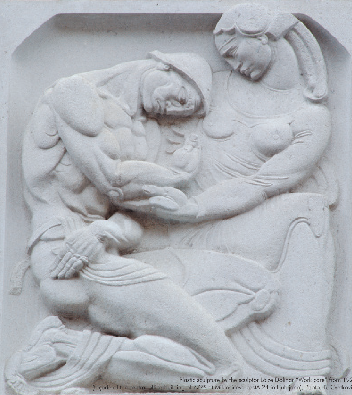
Plastic sculpture by the sculptor Lojze Dolinar "Work care" from 1924 (façade of the central office building of ZZS at Miklošičeva cestA 24 in Ljubljana).